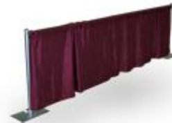
3' High Drape