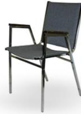
Padded Arm Chair