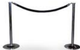
8' Velour Rope