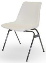
Plastic Side Chair