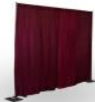
8' High Drape