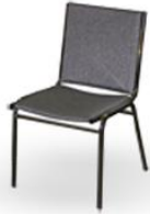
Padded Side Chair